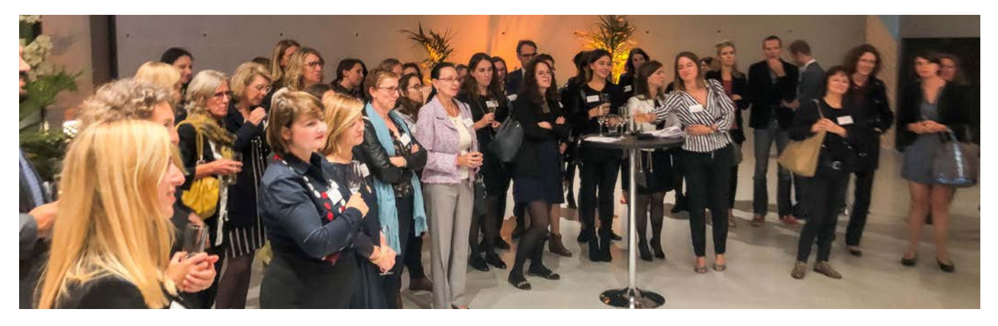
Attendees to Laurence Equilbey's post-concert address, on 25 September 2029