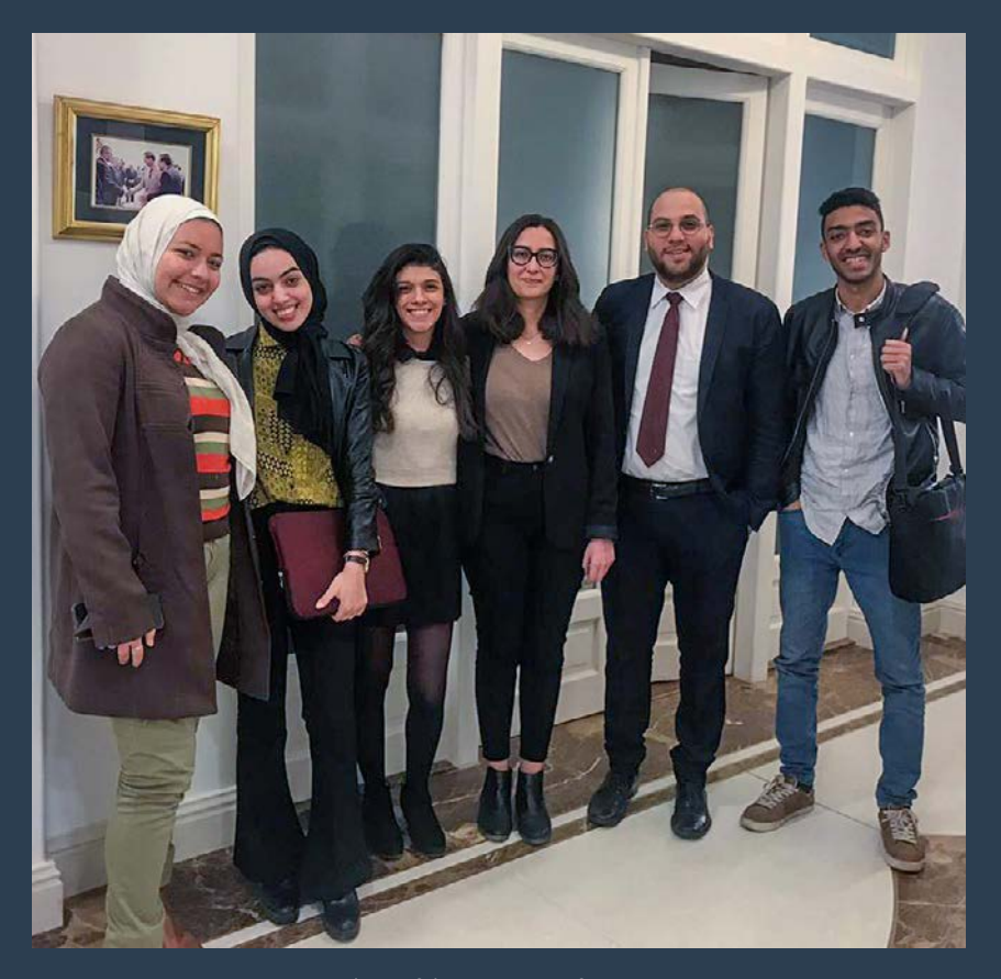
Members of the University of Cairo team