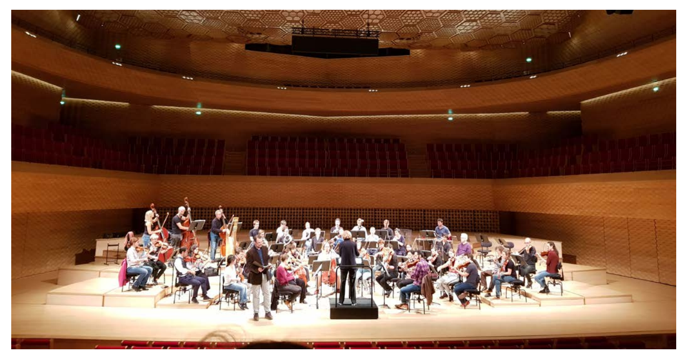
Laurence Equilbey conducting her orchestra at the La Seine Musicale auditorium on 25 September 2019

"Reed Smith's Women's Initiative is designed to ensure that women not only have a place at the table, but that they are also often at the head of the table."